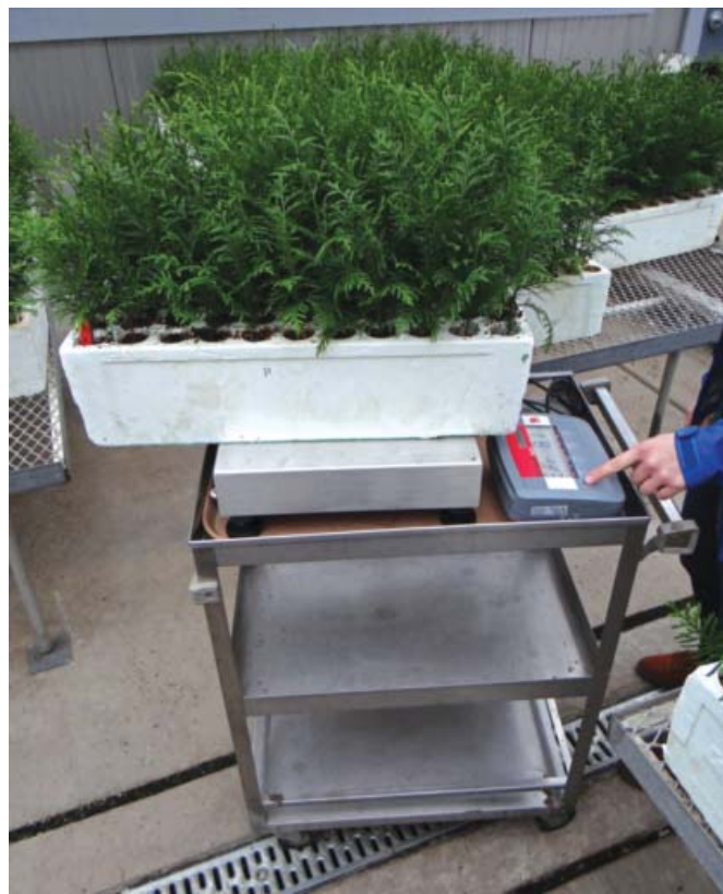
Figure 2. A balance on a cart can be rolled to various locations within the nursery, reducing the amount of time spent transferring containers to and from the balance.