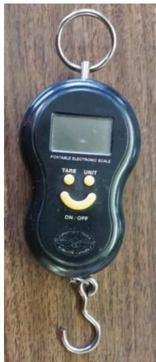
Figure 4. This digital, handheld Chestnut Tools Portable Electronic Scale is used to obtain container weights.

around the crimped hook, and by simply lifting the container upward the container weight can be immediately read (Figure 5). That weight is recorded and compared to target weights to determine if irrigation is required. The wires are recycled from year-to-year. You may be able to find used wires that can be recycled, or they are available from nursery supply companies, ranging in price from US$ 0.40 to 2.40 each. The balance used at PRT Oregon is the Chestnut Tools Portable Electronic Scale (see Figure 4) that sells for about US$ 13 (Lee Valley Tools Ltd; http://www.leevalley.com ). This particular unit can be set to English or metric units, will convert units, and is 99% accurate for loads \geq 1 kg (2.2 lb) to a maximum of 40 kg (88 lb); it shows weights to the nearest one-hundredth, more than enough accuracy.