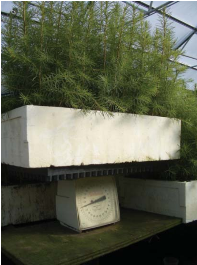
Figure 3. A balance left in place to measure container weights requires no movement of containers or balances, but many balances are needed when multiple species and stocktypes are produced.