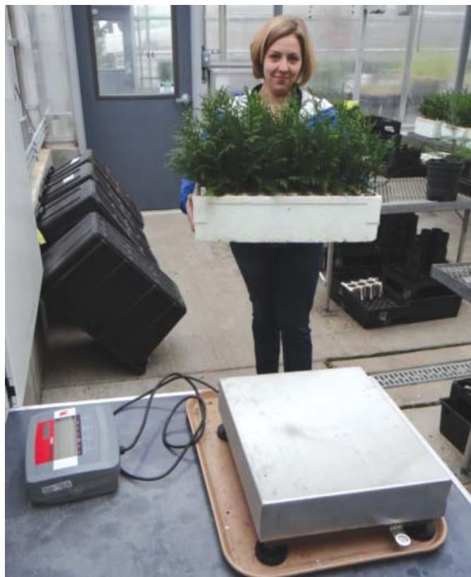
Figure 1. Carrying containers to a stationary balance is one way to determine container weights. This works well where distances are short and only one balance is required.

The PRT Oregon nursery in Hubbard grows more than 70 stocktypes for a total of 10 million seedlings annually, and each stocktype is regularly evaluated for container weight. Therefore, an inexpensive, easy-to-use, and flexible system was required. The solution was to use wire hangers manufactured for hanging floral baskets. Staff take the four, 57-cm-long (22.5 in) wires that have a hook crimped at the end and string each wire through the air vents in the Styrofoam containers, twisting them together underneath so that the container can “hang” like a floral basket. This could, most likely, be done for any type of container that has air vents and is reasonably rigid. PRT Oregon staff record about 120 block weights per summer day using a portable, handheld, digital balance (Figure 4). Without otherwise moving the container, the hook on the balance is looped