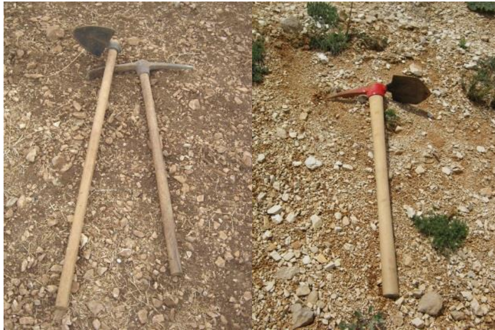
Figure 7. Left: Two tools, a hoe and a pick, were traditionally used to plant seedlings in Lebanon’s rocky soils. Right: Combining them into a new tool has improved outplanting efficiency with reduced labor, and along with target plants, is increasing seedling survival and growth.