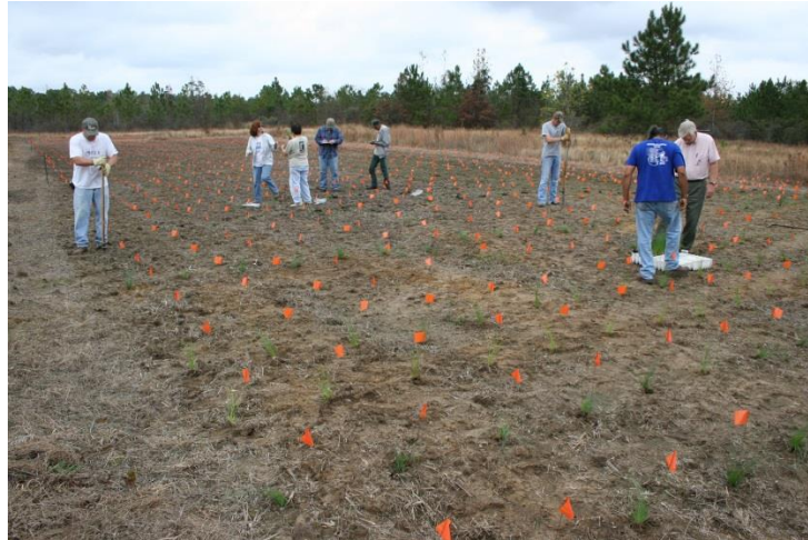
Figure 4. Installing a well-designed stocktype experiment requires minimizing confounding variables during nursery production as well as avoiding them on the outplanting site. When done properly, these studies can provide valuable information for defining target plant materials.

On the outplanting site, key considerations to avoid confounding variables include: (1) plant all stocktypes concurrently and during the appropriate outplanting window; (2) avoid having a single planter responsible for planting a single stocktype or a single treatment (either one planter installs the whole trial or several planters equally share the planting of each stocktype and treatment); (3) use a solid statistical design for appropriate analysis and interpretation (Fig. 4; Owston and Stein 1974; Pinto et al. 2011; Haase 2014).