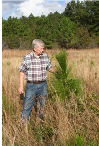
Figure 5. Research showed that Pinus palustris seedlings grown in containers generally have better survival than their bareroot cohorts and more promptly grow out of the grass stage.

guidelines for quality attributes developed from field trials, leading to container seedlings now being the target plant when P. palustris is outplanted (see Jackson et al. 2012).