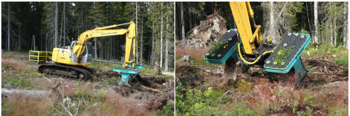
Figure 3. Self-propelled planting machines in Scandinavia can efficiently plant container seedlings on forest sites. The seedlings and machine were designed in concert, and in response to a dwindling, more expensive labor force.