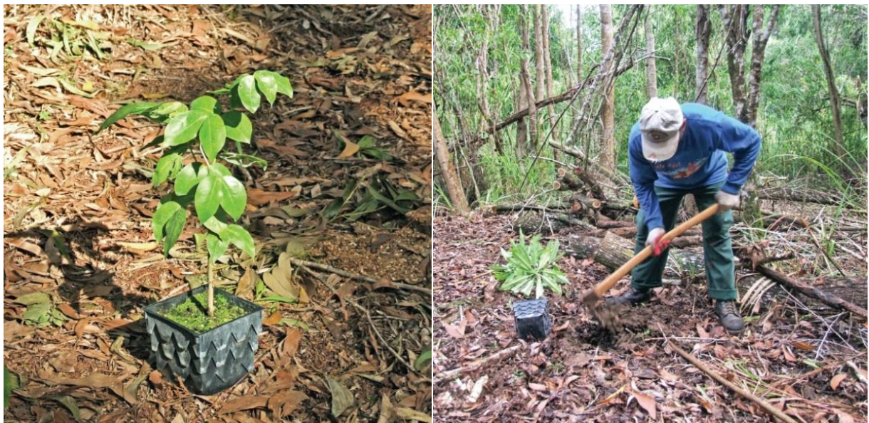
Figure 2. Using the Target Plant Concept, nursery and land managers work together to specify what type of plant material would be best suited for the project. Left: Shown is a native reforestation project in Guam, where target plants included native trees such as Intisa bijuga (Colebr.) Kuntze grown in large, 4-liter root-training square containers. Right: The native seedlings were planted using a mattock in soft clay soil.

Short, non-rooted cuttings (< 30 cm or so) can be used to start plantations, especially those for biomass production. Long, non-rooted cuttings (1.5 to 5 m) might be used for specialty projects, such as riparian restoration or plantation establishment without supplemental irrigation, where they can be inserted deep enough into the soil such that the proximal ends are in contact with the water table.