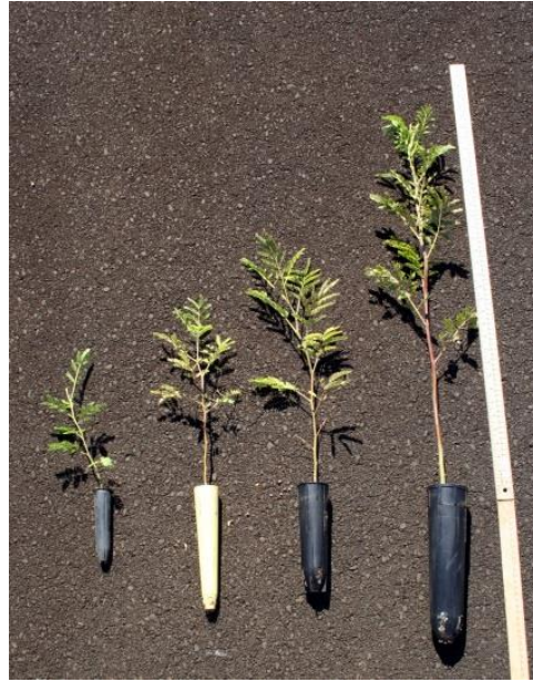
Figure 6. These Acacia koa seedlings are all the same age. The seedling on the left is the current stocktype widely outplanted, and performs well on sites where competition is controlled and herbivores are excluded. The seedling on the far right has been shown to thrive better than the small stocktype on highly competitive sites. Because the larger seedling grows faster, it may be desired when an objective is reducing time to canopy closure.